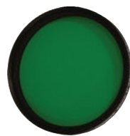
Part # ACC-16GF