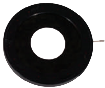
Part # ACC-16ID