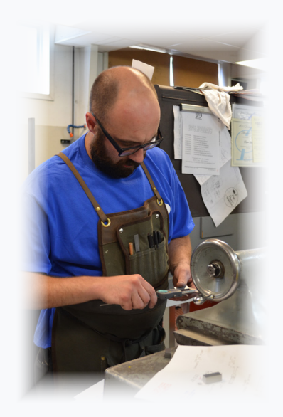
Dorsey Products - proudly made in the USA