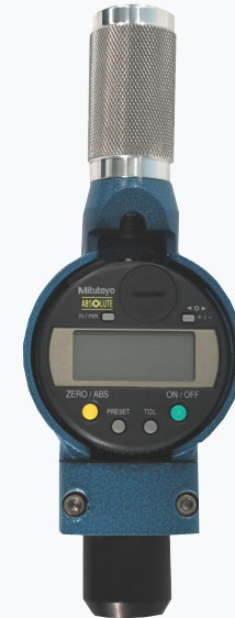
Digital or independent dial indicator housing Pt # DX4-81035 for most digital indicators Pt # DX4-81040 for DM series digital indicators