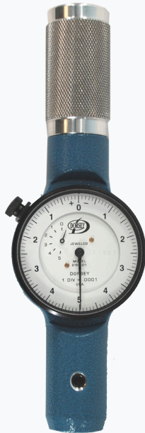
For .625" dia. shaft Part # Example: DS-2150-01 Standard unit