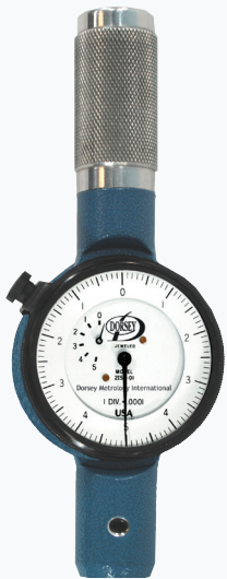
For .500" dia. shaft Part # Example: DS-2150-01-2