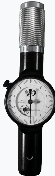
For .625" dia. shaft Part # Example: DS-2DM025-01