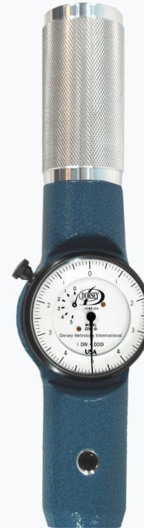
For 1" dia. shaft Part # Example: DS-2150-01-6