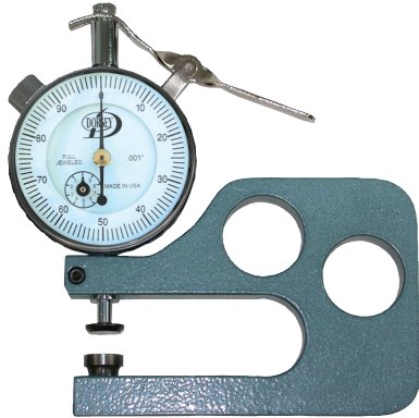
Part #FC1 1/2" dia. anvils, 1" opening, 2" throat depth, with 2DM500-10F .001" Grad. dial with .5" travel

Recommended for quick thickness checks of flat sheet materials and wide variety of small parts. Supplied with hardened steel gaging contacts, lifting levers, and clockwise continuous dial indicators. Special frames, throat depths, and contacts can be made to suit application. Available with ISO 17025 certification.