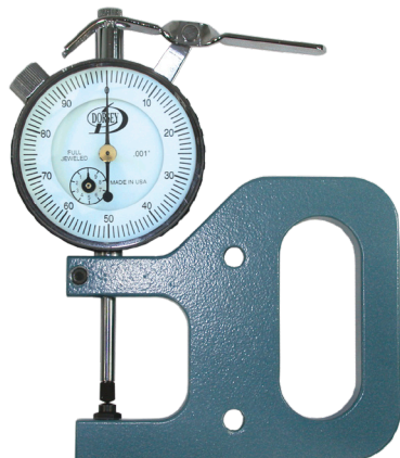
Part #FC3 Spherical contacts