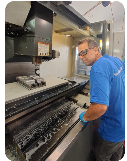
Dorsey Products - proudly made in the USA