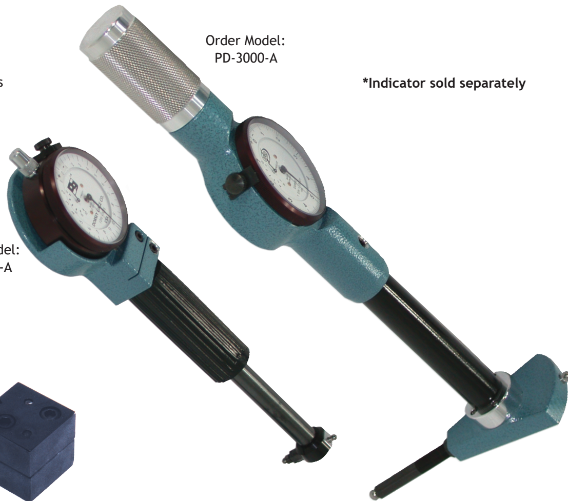
Order Model: PD-3000-A