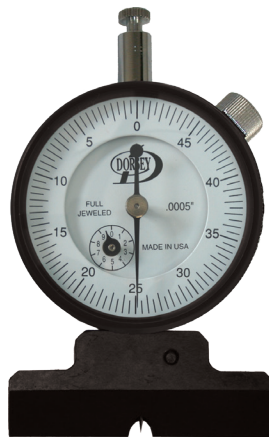
Shown is DDG-125C

Used to measure depths of small holes, engravings, rivets, or slots with extreme accuracy. Knife edge base with center cut permits unobstructed view of point for exact positioning.