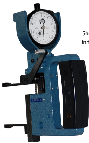
Shown with 2DM125-05 dial indicator .0005" graduation.