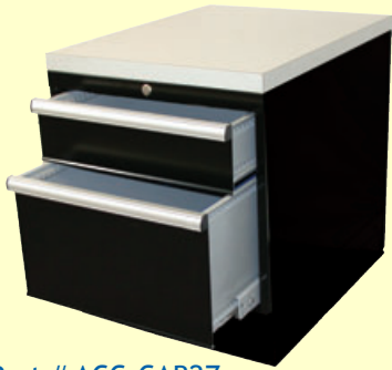
Part # ACC-CAB27