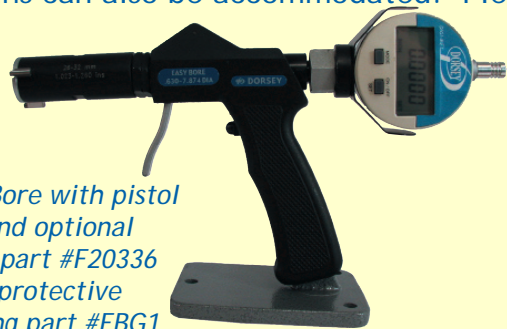
Easy Bore with pistol grip and optional stand part #F20336 Ultra protective housing part #EBG1

These rugged retractable bore gages are ideal for inspection on the shop floor or in the laboratory. They feature a series of 24 interchangeable heads and 2 handles to accommodate the complete range of diameters between .236" and 7.87". Special heads with application specific contact lengths can also be accommodated. Please contact us for details.