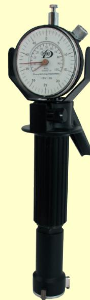
Easy Bore with lever handle