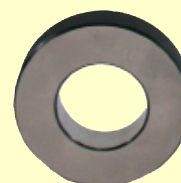
*Indicator sold separately