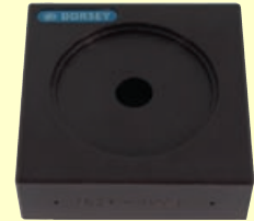
Part #TLDI-4001 Holding Fixture